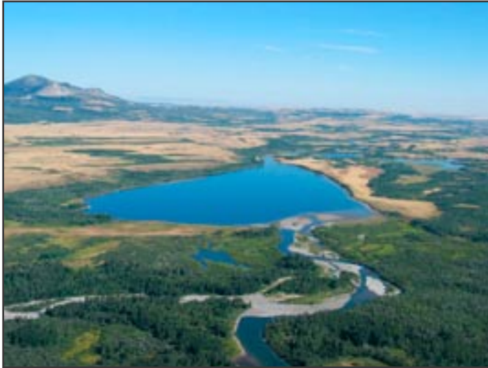
Aerial view of Lower Waterton Lake and the fescue grassland / aspen parkland area of the park

182 bryophytes and 218 lichen species (this represents more than half of Alberta's plant species, and more species than Banff and Jasper National Parks combined). About 179 of the vascular plant species in WLNP are rare in Alberta, and 22 of these are not found anywhere else in Alberta.