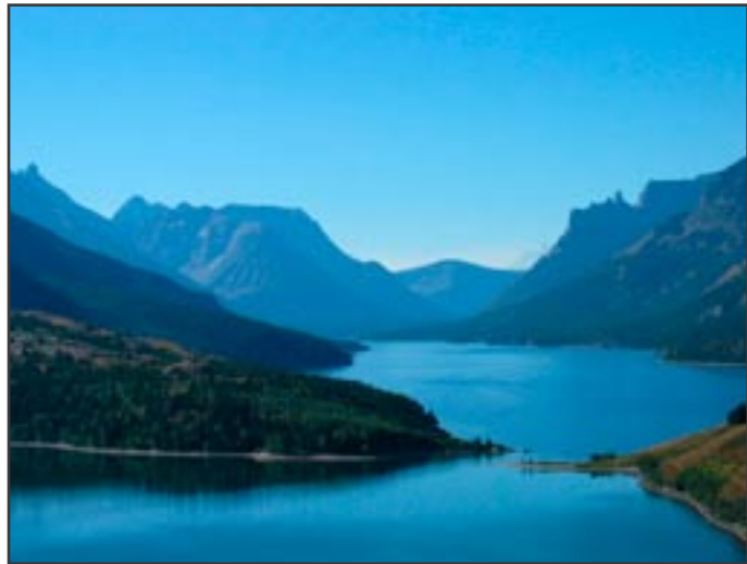
Middle and upper Waterton lakes looking south