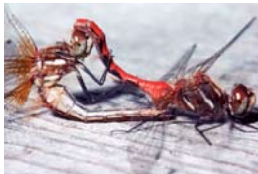
Sympetrum pallipes, mating pair. Behavioural research on the Odonata is popular.