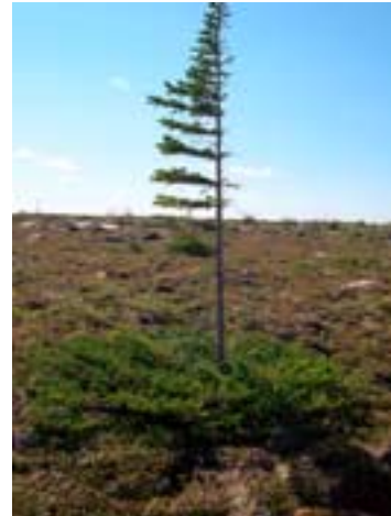
Krumholz-modified spruce tree on shore of Hudson Bay east of Churchill, with characteristic shortened branches on windward side and normal branches on leeward side. Note the luxuriant growth that would be below the snow cover.

The facilities at the CNSC are highly appropriate for this kind of course. The centre includes laboratory space, classrooms, and extensive dormitory and kitchen facilities (cook included!). Station employees provide excellent support; notably, in 2003, David Wright, who acted as bus driver, bear guard, and tour guide. Between the facilities and the people, the CNSC provides a highly enjoyable and safe environment, and a splendid atmosphere for learning. The NSERC Major Facilities Grant will improve the infrastructure of the station, and allow for the establishment of a small insect museum for general reference with storage cabinets from the University of Manitoba designated for transport to the CNSC. The collection is expected to grow through the efforts of the students on the course. Biological diversity is the hall-mark of the course and it is hoped that genetic and molecular diversity can be incorporated as facilities are upgraded.