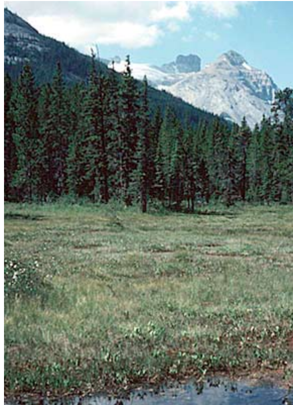
Yoho National Park, BC. In the western mountains, small peatland pools are good places to look for boreal species of dragonflies.

(Classic biological writing of strong historical interest.)