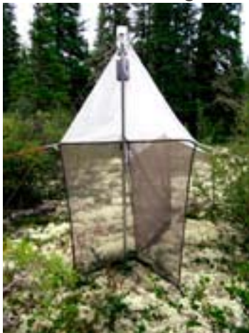
Malaise trap in bed of crustose lichens in spruce forest, ca. 20 km south of Churchill Northern Studies Centre.

Malaise Trap – A standard malaise trap was used with a trough under the centre panel.