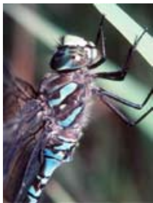
Aeshna canadensis male. Odonata are excellent subjects for scientific study. Recently the order has caught the interest of more and more naturalists, students and the general public.

(sharing information on the Odonata of the Great Lakes region; sponsored by the Michigan Odonata Survey.)