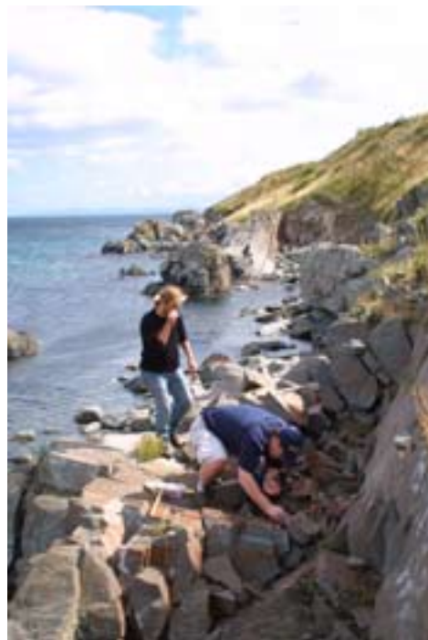
Collecting Petrobius in Newfoundland

Until 1998, most effort focused on surveying the fauna of NF & LB, especially aquatic and semi-aquatic groups, resulting in numerous and sundry publications. Since 1998, a larger synthetic effort was undertaken to develop comprehensive lists, databases and analyses to describe the terrestrial arthropod fauna of NF & LB and, where feasible, to produce illustrated keys to all known species. It is