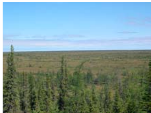
A view from spruce forest on esker ridge of extensive fen complex south of Churchill Northern Studies Centre.