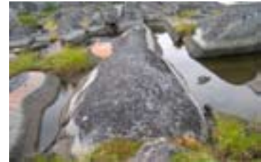
Rock pools on bluffs east of Churchill. These pools contained a high species richness of water beetles.

Aquatic collecting – Rob Roughley and Eric Chapman ran bottle traps (recycled 2 L pop bottle design) in almost every kind of aquatic habitat during the duration of the course. They were also used in one of the student projects. The water beetle fauna was sampled extensively with bottle traps and net collecting. This will add significantly to the known fauna of water beetles with at least 10 new records for species from Churchill and one new family (Elmidae) which may well represent the most northern record of the family in North America. Interestingly, the known fauna of Dytiscidae for Churchill was increased by five species over the 73 species recorded by Larson et al. (2000) [Larson, D. J., Y. Alarie, and R. E. Roughley. 2000. Predaceous diving beetles (Coleoptera: Dytiscidae) of the Nearctic region, with emphasis on the fauna of Canada and Alaska . NRC Research Press, Ottawa, Ontario, Canada. 982 pp.].