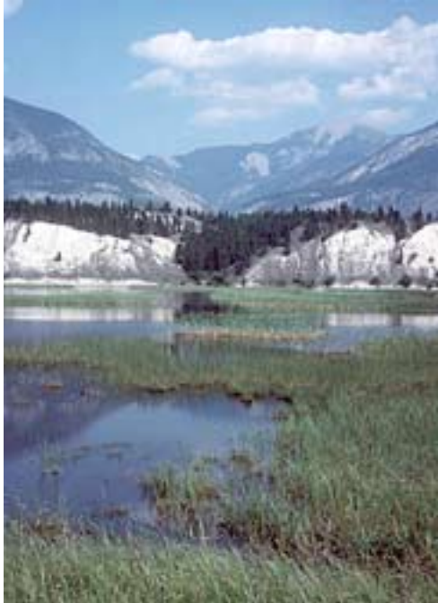
Columbia River marshes, Invermere, BC. The rich marshes and ponds of southern Canada support some of the most diverse dragonfly communities in the country.

Tillyard, R.J. 1917. The biology of dragonflies.