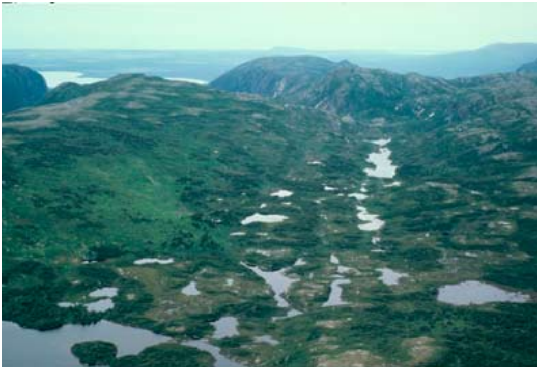
Long Range Mountains, Gros Morne National Park, Newfoundland