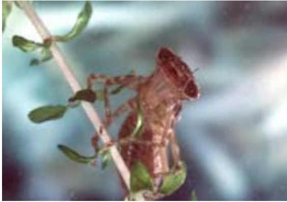
Larva of Aeshna interrupta . Studies on the detailed habitat requirements of larvae are high on the list of the most needed odonatological research.